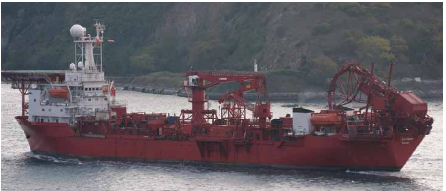
2011, Gsp Falcon Istanbul Strait passage