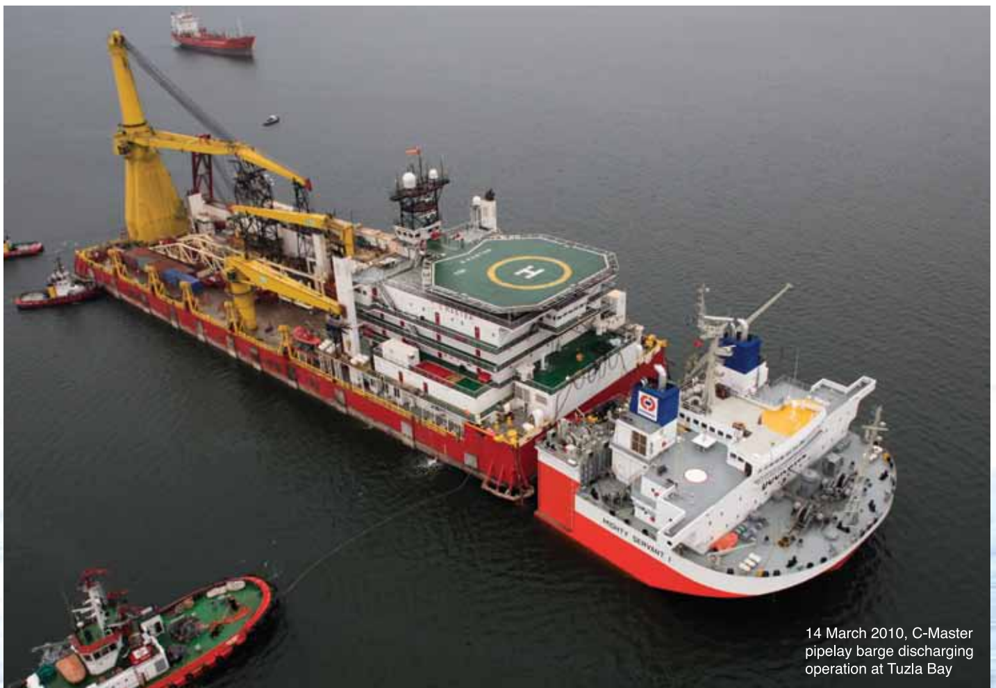
14 March 2010, C-Master pipelay barge discharging operation at Tuzla Bay

During offshore operations, our main job is to connect vessels and rigs to shore bases. We are following latest global technologies and other applications. Mostly, drilling depths in Turkey are not more than 90 m and 20 nm away from shore. In order to make a fast and safe link from shore bases to project areas, we have 3 fast HDPE boats in our inventory. All boats are produced in our facility in Istanbul. We have completed certification and registration by Turkish Lloyd. We are providing all kinds of logistic services with our boats, which are fully equipped and adapted for offshore operations.