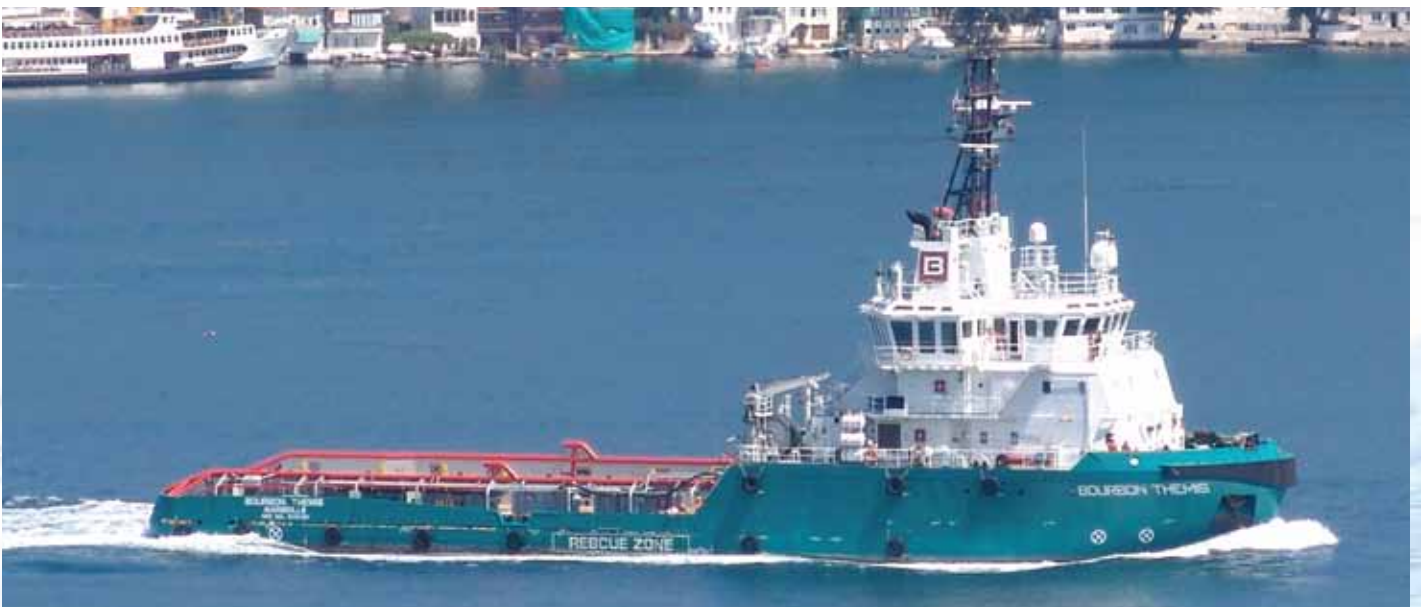
2010, Bourbon Themis Istanbul Strait passage