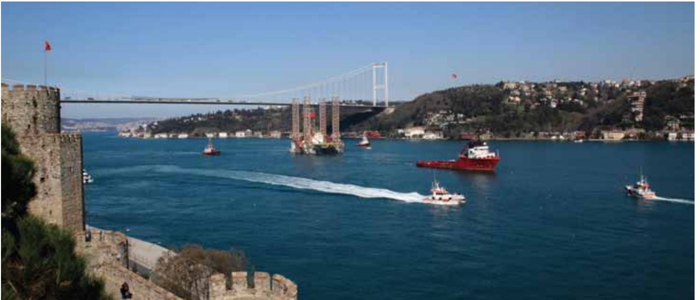
2010, Gsp Saturn Istanbul Strait passage